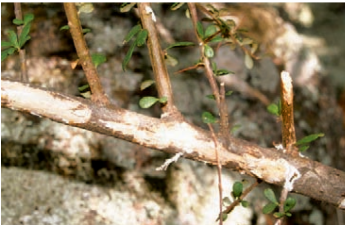
FIGURE 2: Rabbit damage showing stripping of bark and 45° ‘secateurs-like’ cuts through twigs.