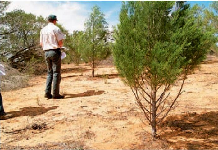
FIGURE 3: Absence of small seedlings and a distinct 'browse-line' 500 millimetres above the ground on older saplings indicates severe rabbit impact (Damage score = 5).

In some instances rabbits may have eaten all of the seedlings but the severity of grazing can still be ranked at '5' from the presence of a distinct 'browse-line' 500 millimetres above the ground on older saplings or mature shrubs with lower foliage within reach of the rabbits (see Figure 3 ).