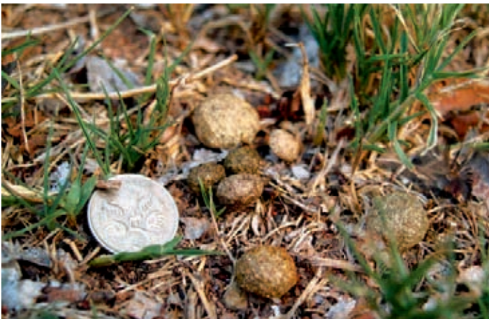
FIGURE 1: Typical small clump of rabbit pellets (faeces) in grassland.