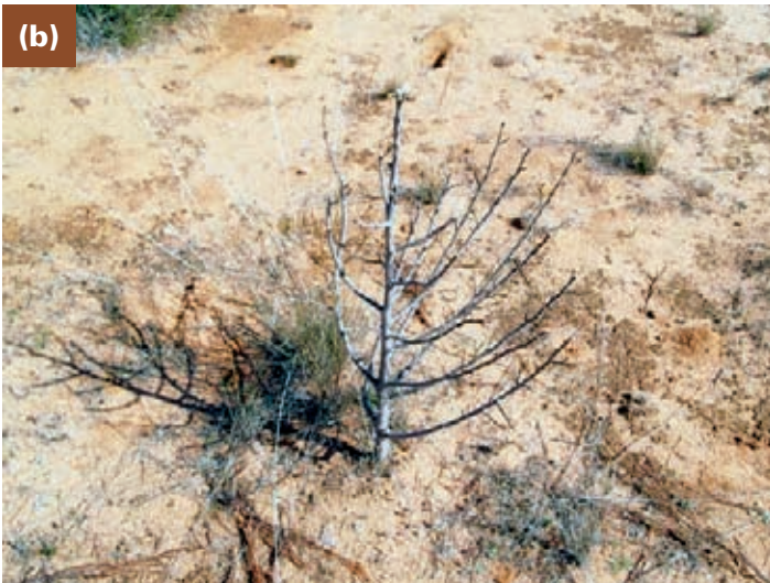
FIGURE 4: Native pines with: (a) little damage (score 1); or (b) complete defoliation (score 5).